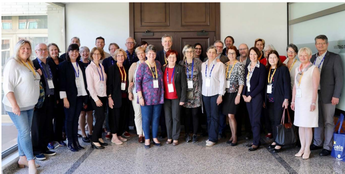
Eaquals Inspectorate, Madrid, 2019.

co-inspectors, and attendance of at least one face-to-face Continuous Professional Development session every two years; this may be replaced in any one year by on-line standardisation tasks. The inspectors carry out both initial inspections and re-inspections. The current team of inspectors comprises 55 inspectors; 36 are freelance inspectors and 19 are employed by accredited members.