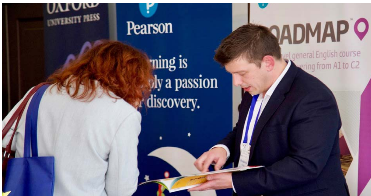
Eaquals Associate Member, Pearson, at the Annual International Conference in Madrid, 2019

Eaquals has 34 Associate Members based in 17 countries. Our Associate Members bring a wealth of professional expertise to the Eaquals network and provide invaluable support for many of our educational projects. They comprise a diverse group of influential organisations involved in language education. They range from national associations of language education providers to national public-sector bodies responsible for promoting language and culture e.g. Institute Cervantes, language examination providers, publishers of learning materials and a French government institution for language study and research.