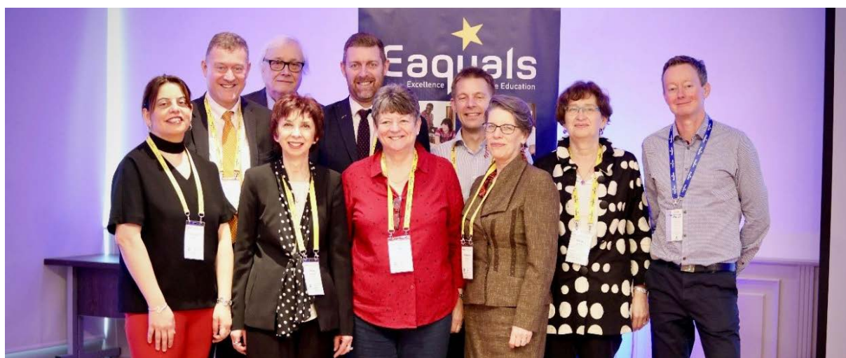
Eaquals Board of Trustees, Madrid, 2019.

The trustees report includes notes to the financial statement as a post balance sheet non-adjusting event.