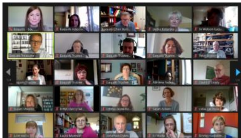
Eaquals Trustees, Staff and Members at the 2020 online AGM.