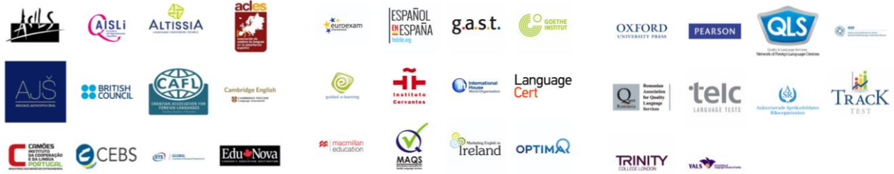
Equals Associate Members, 2020