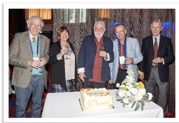
Attendees at the 2021 Annual Conference Gala Dinner