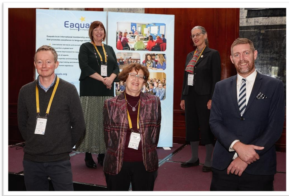
Some of the Eaquals Board of Trustees at the Annual Conference in Belfast, October 2021

Eaquals (Evaluation and Accreditation of Quality Language Services) was founded in 1991 as the European Association for Quality Language Services. The name was later changed to reflect Eaquals’ development at global level.