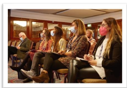
Attendees at the 2021 Annual Conference

As a result of the Covid19 pandemic, Eaquals postponed the annual conference for 2020 and this finally took place on 21 st -23 rd October 2021 at the Europa Hotel in Belfast and was run as a hybrid event with the conference also being accessible online.