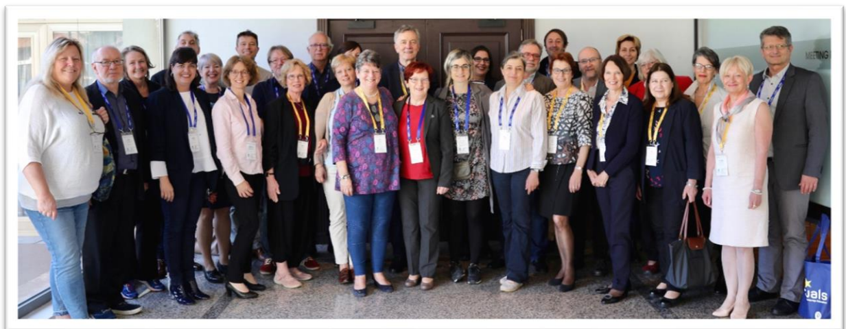
Eaquals Inspectorate at training during the annual conference in 2019.