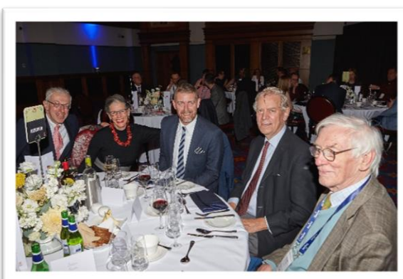
Attendees at the 2021 Annual Conference Gala Dinner