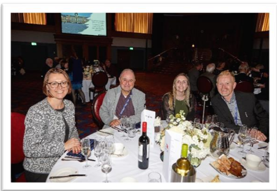
Attendees at the 2021 Annual Conference Gala Dinner