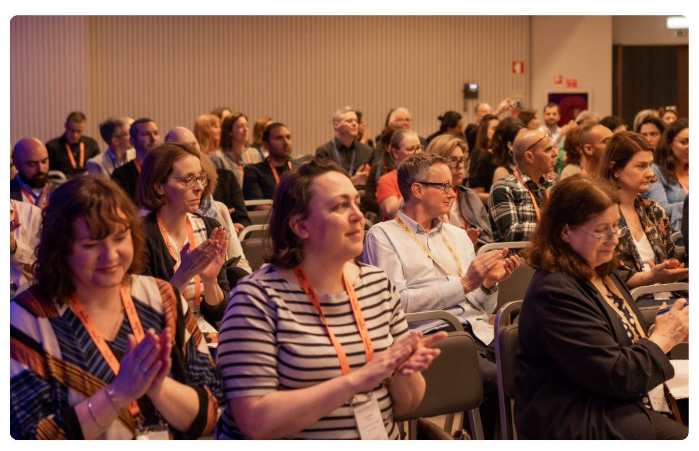
Attendees at the Eaquals conference 2024

the European Profiling Grid (EPG) and the ALTE Principles of Good Practice 2020. Designed to be engaging, diverse, and goal-oriented, the LAPP offers participants a valuable opportunity to enhance their skills in evaluating students' language competencies.