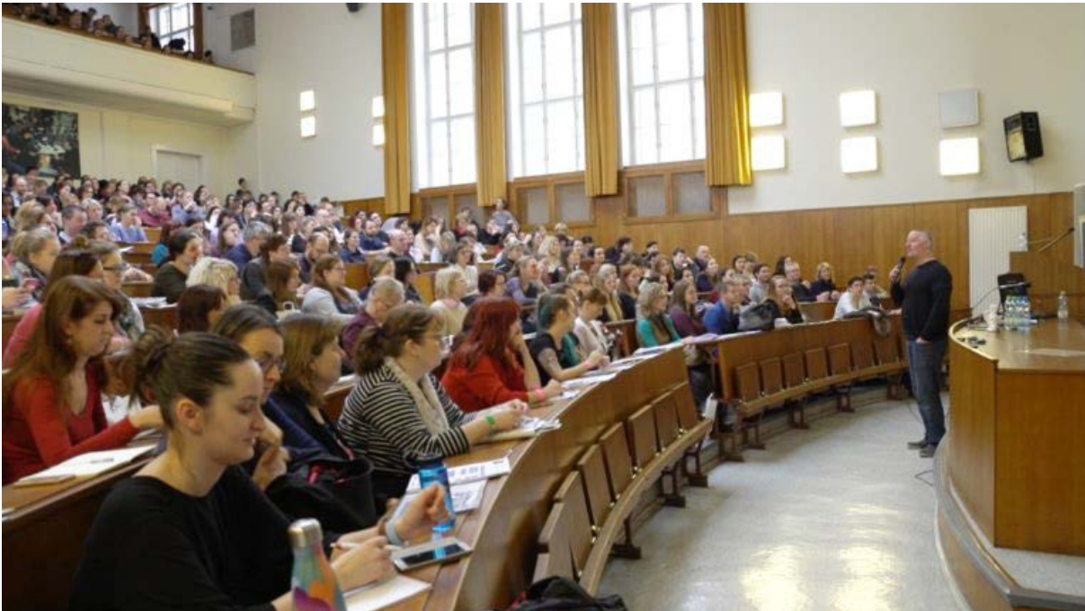
Members of Association of Language Schools Czech Republic, Equals Associate Member & recipients of Equals Member Event Fund 2018.