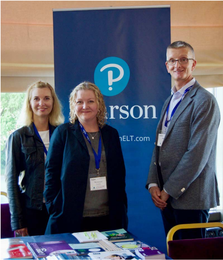
Eaquals Associate Members, Pearson at the 2018 Eaquals Annual International Conference in Prague.

In addition, there are 3 organisations (from 3 countries) which are Project Partners, all but one of which are university language departments. Project Partners do not have voting rights in Eaquals but make an important contribution to our network and academic work.