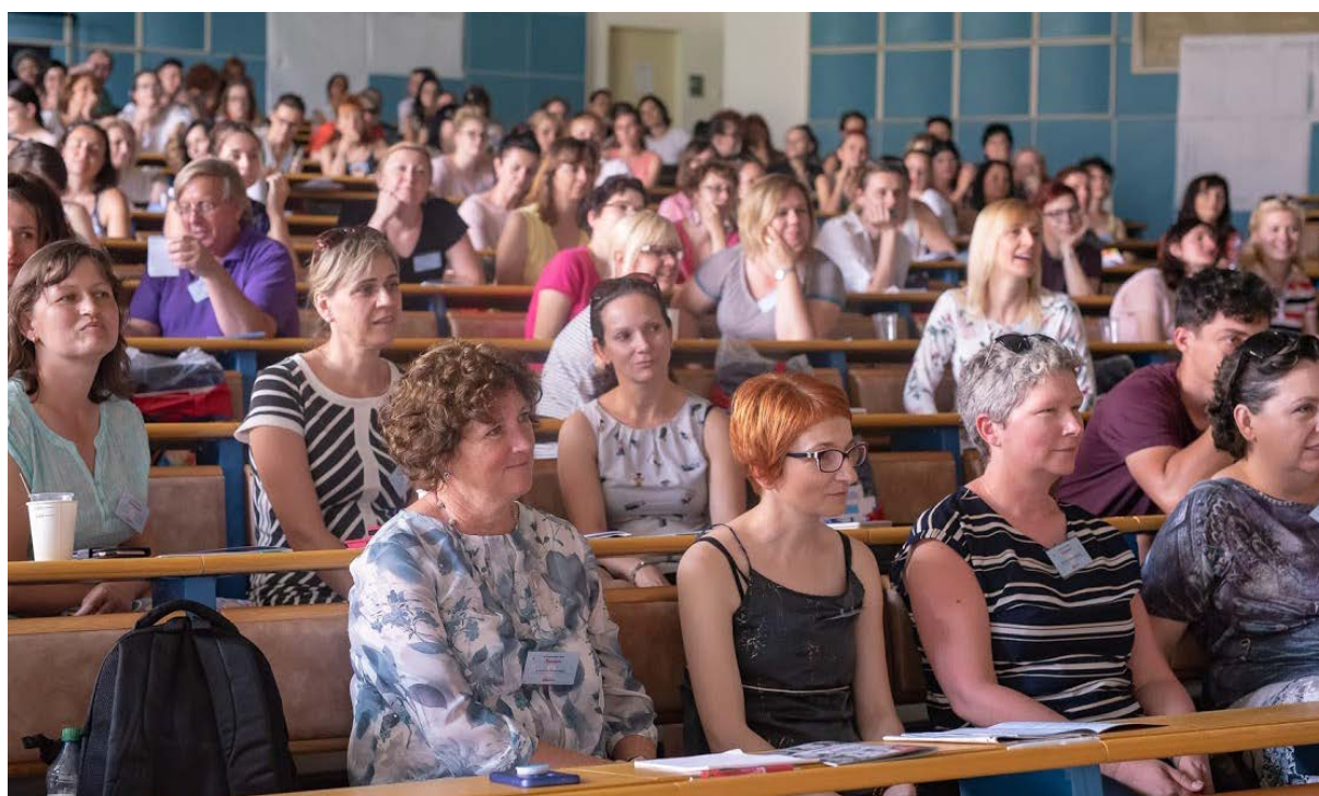
Participants at the ELT Forum, Bratislava, 31 May - 1 June 2018.