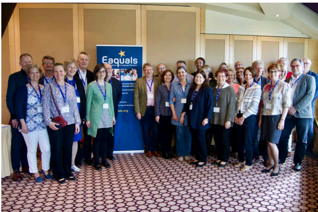
Group of Eaquals Inspectors at Training Day, Prague, 26.04.2018

Eaquals inspectors are themselves language education professionals with considerable managerial and international experience who have successfully completed training in the Eaquals inspection scheme. They develop and maintain their expertise through regular professional development and standardisation sessions. The inspectors carry out both initial inspections and re-inspections.