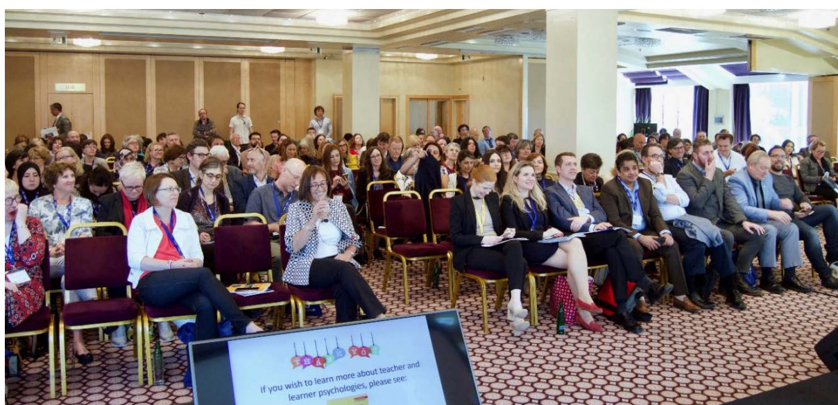
Attendees at the Equals 2018 Annual International Conference, Prague

It was announced during the conference AGM that Equals will launch a scholarship award scheme, which will enable Equals-accredited institutions disadvantaged by challenging business environments, unfavourable exchange rates and local political issues, to benefit from funding to attend the Equals conference.