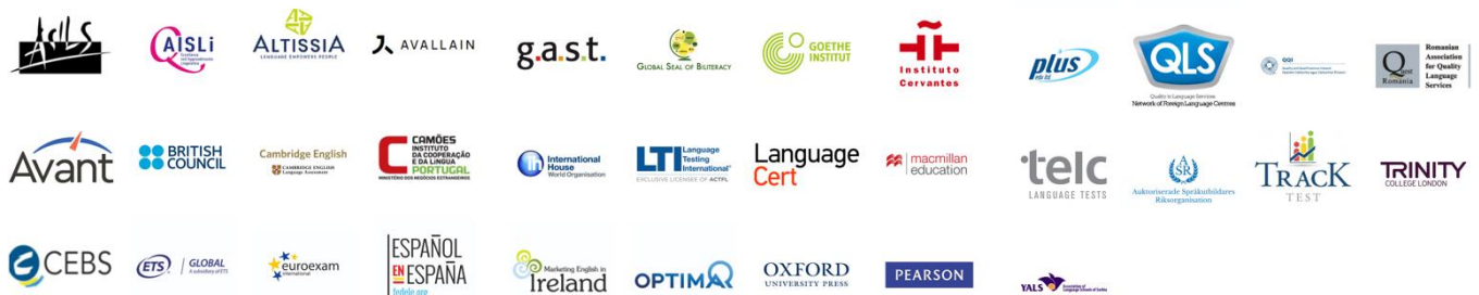
Eaquals Associate Members

In addition, there is 1 organisation which is a Project Partner. The Project Partner does not have voting rights within Eaquals but makes an important contribution to our network and academic work.