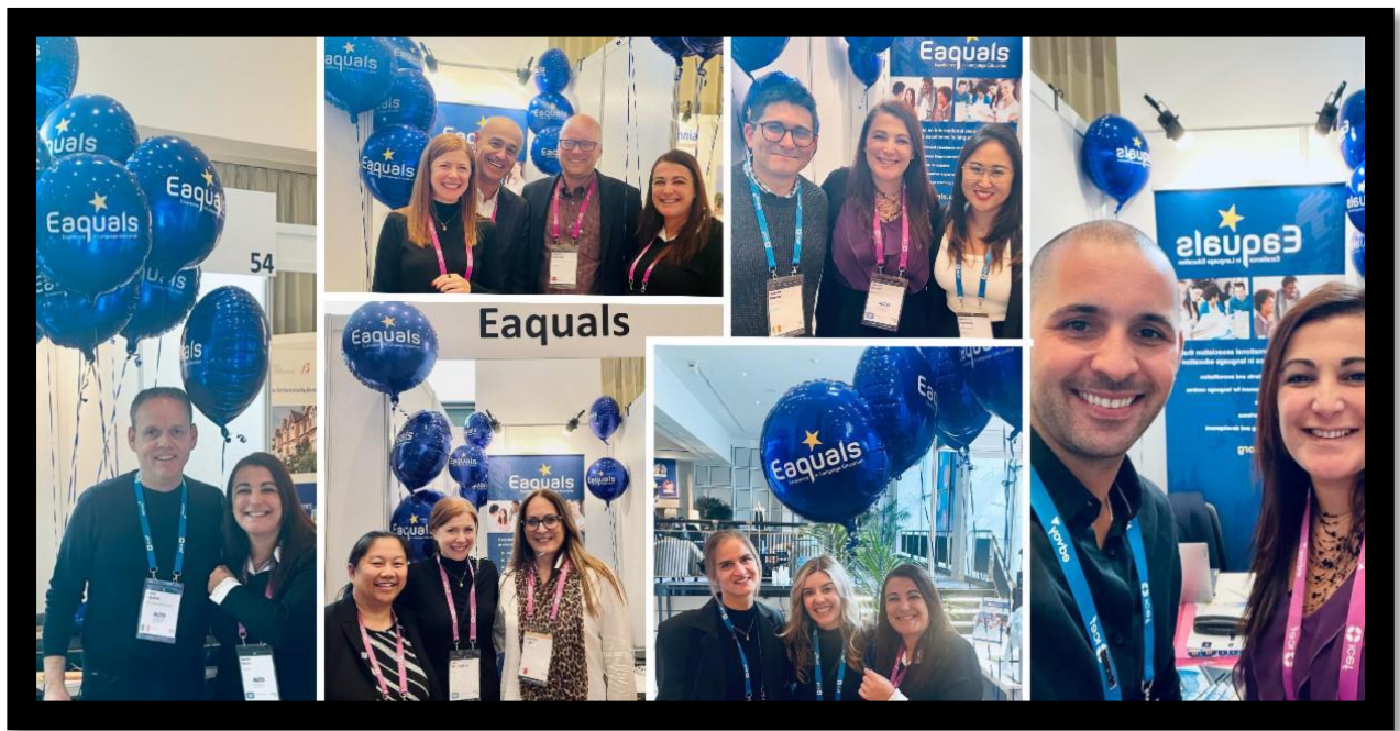
Eaquals at ICEF Berlin with a number of our Accredited and Associate members.