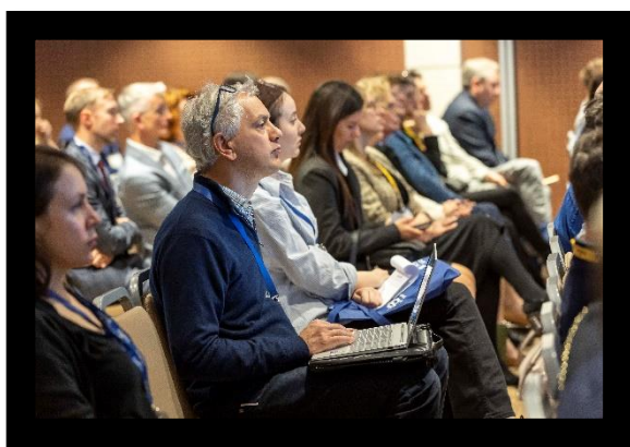
Attendees at the 2023 Annual Conference

The Eaquals Annual Conference 2023 took place in Tallinn, Estonia from the 27 th -29 th April 2023 and was well attended by both members and non-members from within the international education sector.