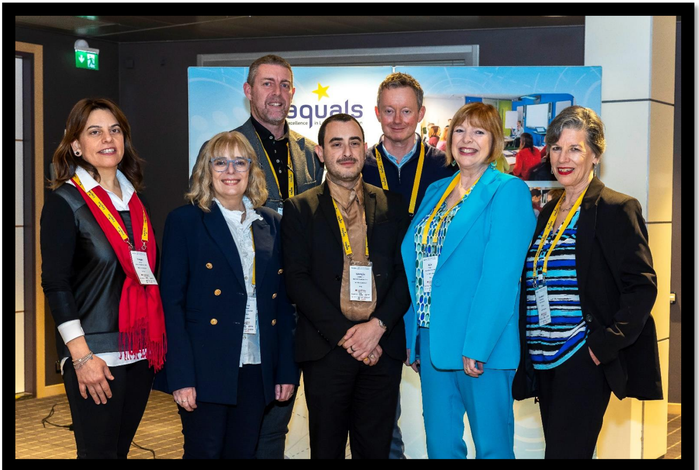
The Eaquals Board of Trustees at the Annual Conference in Tallinn, Estonia (April 2023)

Eaquals (Evaluation and Accreditation of Quality Language Services) was founded in 1991 as the European Association for Quality Language Services. The name was later changed to reflect Eaquals’ development at global level.