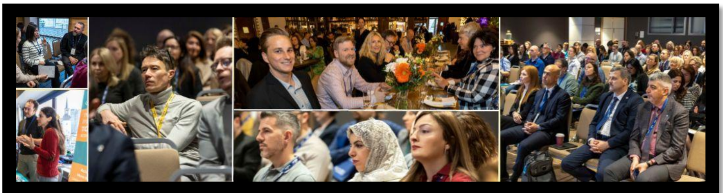
Attendees at the Eaquals Annual Conference 2023