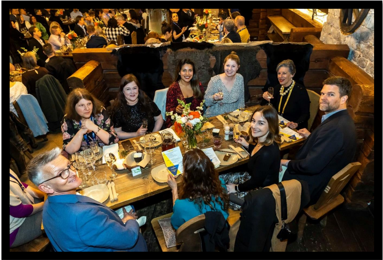
Attendees at the Eaquals Gala Dinner 2023