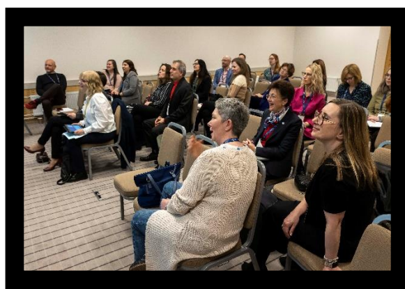
Attendees at the 2023 Annual Conference