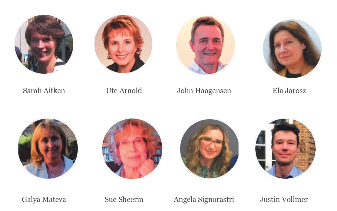
Eaquals Accreditation Panel, 2022

inspection reports, decides the outcome of each inspection, and oversees the development of the inspection scheme. Panel members are appointed by the Board of Trustees.